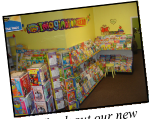
Check out our new reading room!

Furniture: Age-appropriate chairs, cots, mats and more!