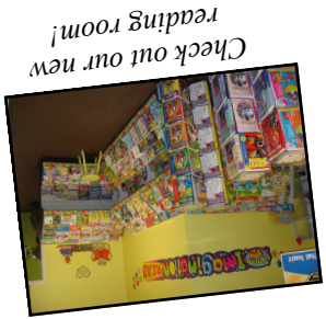
Check out our new reading room!

Hawaii's Largest Selection of Education Materials and Learning Supplies!